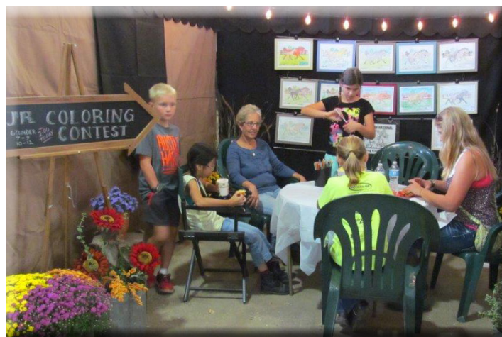
Artists enjoy the coloring booth as a place to work on their entry and enjoy visiting. Entries were displayed on the wall in the gallery and were judged in three age divisions.