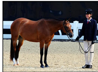
GLENCOE CHARTER PARTY, Half Welsh (*Telynau Royal Charter x Glencoe Argosy) 6th Model