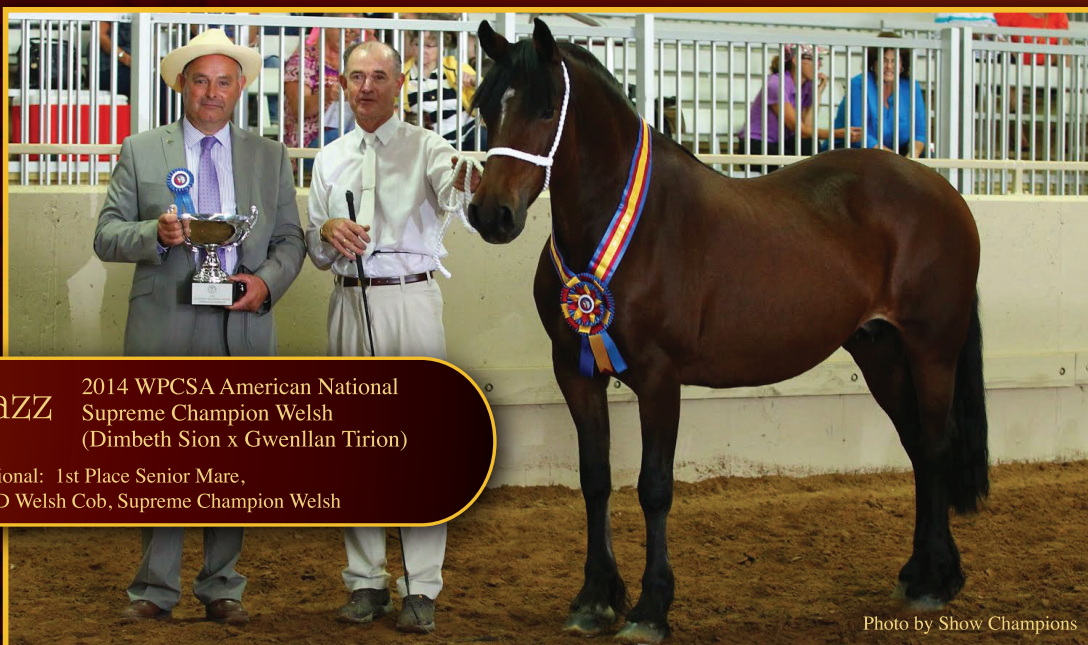
Teifi Judy Jazz 2014 WPCSA American National Supreme Champion Welsh (Dimbeth Sion x Gwenllan Tirion)

2014 WPCSA American National: 1st Place Senior Mare, Grand Champion Section C/D Welsh Cob, Supreme Champion Welsh