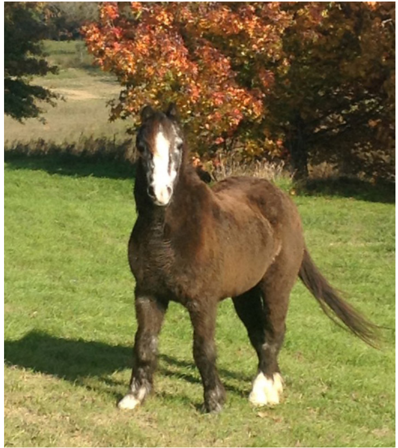
Bristol Elan at 32 years of age

I hope these things can be a help to some of you as your ponies age. Old ones still enjoy company, brushing, scratching, an occasional bath etc. Elan loved being free and doing her own thing. She was spirited and tough right to the end. I learned far more from her than I ever taught to her, about class and dignity and the fighting spirit, about perseverance and grace. She had a bright shining face, even in the moonlight, and we will miss her so.