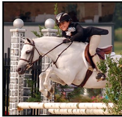
LAND'S END LADY SLIPPER, Section B (*Carolinas Red Fox x Land's End Bellflower) 13th Overall, 5th Under Saddle, 15th Over Fences