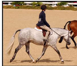
THE PIED PIPER (Daddy's Sandstone Sandpiper), Half Welsh (Brookside Zig Zag x Plain Jane) 9th Under Saddle