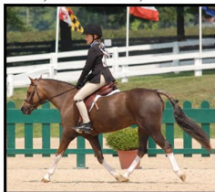
POSH PONYTAIL RIBBONS, Section B (Gayfield's The Sleuth x Gayfield's Butterfly Tattoo) 4th Model, 20th Under Saddle

SPICE IT UP (Lucky Irish Charm), Half Welsh (Mighty Hershey x Clovercroft's Irish Lace) 14th Model