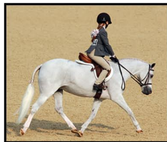
CLOVERCROFT LOVE BUNNY (Clovercroft Over the Veranda), Half Welsh (Clovercroft Brenin x Clovercroft's Polyester) 20th Under Saddle