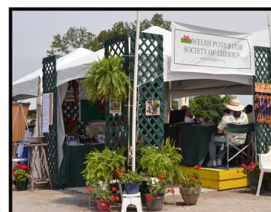
The WPCSA Booth set up ringside at the 2014 US Pony Finals