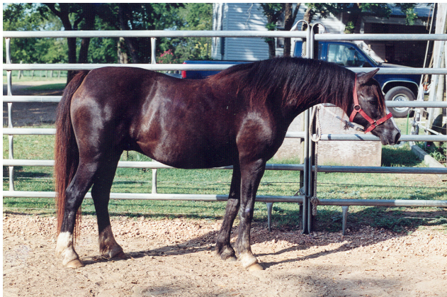
Elan at 16 years and in foal