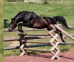
Standing at public stud Maple Side Mr. Magic