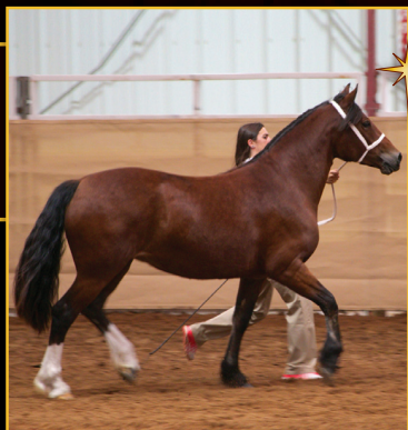
MHS All That Jazz

Two Year Old, Welsh Cob Filly Minyffordd Megastar, LOM x Teifi Judy Jazz by Dimbeth Sion