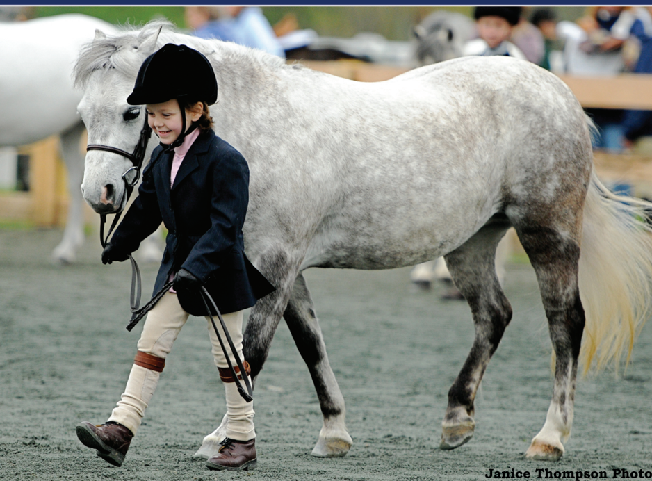
Janice Thompson Photo