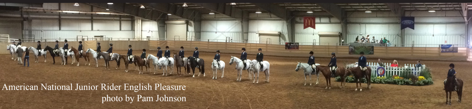
American National Junior Rider English Pleasure