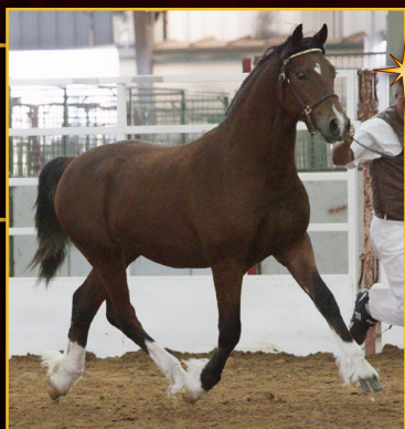
MHS Mega Jazz

Yearling, Welsh Cob Colt Minyffordd Megastar, LOM x Teifi Judy Jazz by Dimbeth Sion