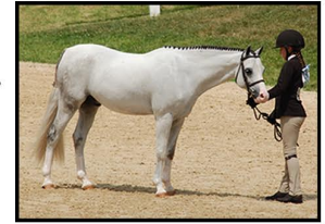
FARMORE STATE OF THE ART, Section B (*Eyarth Grenadier x *Telynau Ballerina) 9th Model

BLUE STETSON, Section B (GlanNant Sunray x GlanNant Allspice) 18th Model PARTY CRASHER (Tantallon All American), Section B (Benlea Rambler x Findeln Siren) 8th Model