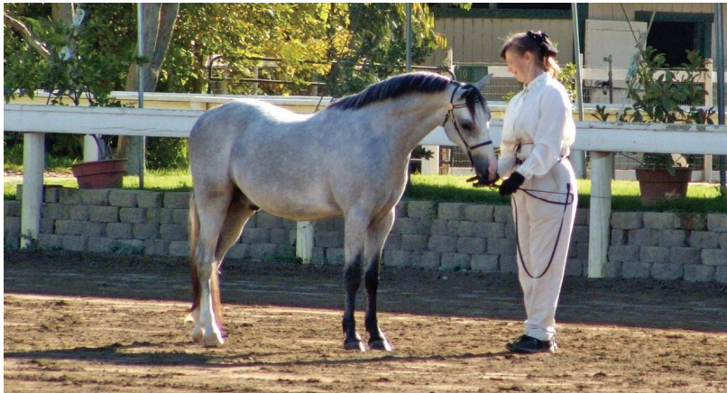
Section A Gelding Silvandra's Hot Rod (Gayfields Now You See It x Silvandra's Lady Hawk) WPCSA Res. Nat. Champion Section A Gelding (2 & Under) NW Region Champion Section A Gelding (2 & Under) Silvandra's Welsh Elmira, OR