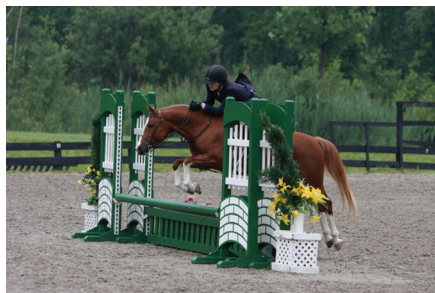
Misty Morn's Just Mo