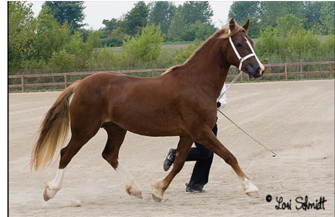
Section D Mare Castleberrys Athanasia (Gwynfaes Culhwch x Bannockburn Belle) 2011 Reserve Champion North Central Region Section D Mares Castleberry Welsh Cobs Spencer, IN