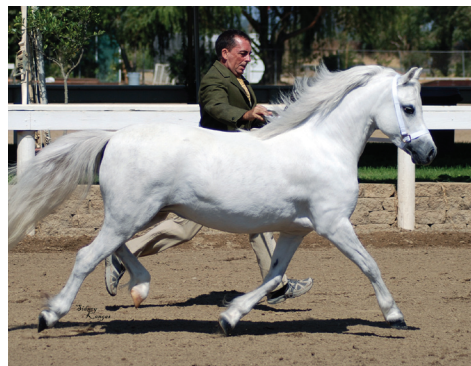
Supreme Champion *Verdrefawr Marina

Some of the "perks" that were offered: folks who brought 5 or more ponies were given a free stall; those who submitted their entries by the "early entry date" qualified for a free stall drawing; Bonus cash prizes were awarded for each Performance Division with three or more entries as well as the Breeding Division at the Western National; there was a free exhibitor's dinner for all who entered by the final pre-entry deadline; we had a "Fun With Fido" event one evening, where all the exhibitors who brought their dogs gathered for doggie games. The facility has a swimming pool that our exhibitors love. The facility manager provides "extras" during the show, such as "Fiesta night", snacks, and an ice cream social – all in an effort to make the show more fun for the exhibitors.