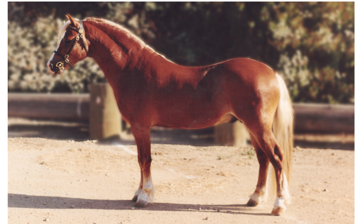
Section A Stallion *Ceulan Lwcus LOM/AOE/OD (Twyford Sprig x Lisvane Lotus Blossom LOM) Section A Sire of the Year #2 Overall Welsh Sire of the Year Gaslight Farm Roseburg, OR