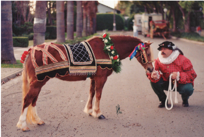
Section A Mare *Ceulan Lorelei LOM (*Trefaes Taran x Lisvane Lotus Blossom LOM) WPCSA Individual Legion of Merit Gaslight Farm Roseburg, OR