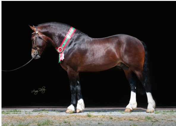
Supreme Champion *Nebo Knight Ryder

We were also very happy to see 8 small competitors in the Walk Trot and Child's first pony classes. It's always encouraging to see the next generation coming to the show and competing. Following these classes for the younger children, the breed classes were started.