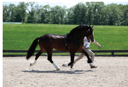
*Nebo Knight Ryder