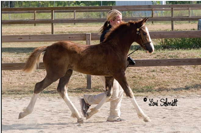
Section D Filly Castleberrys Chanel (Castleberrys Ffame ap Culhwch x *Tuscani Myfanwy) 2011 Reserve National Champion Section D Filly Castleberry Welsh Cobs Spencer, IN