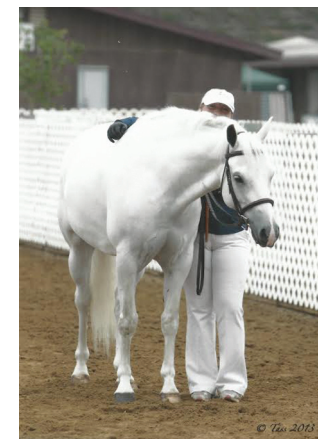
Half-Welsh Gelding Lazy J Bailefs Cowboy (Flying Diamond the Bailef X AMS Skippity Do Da) WPCSA Champion English and Western Half-Welsh/PB 17 & Under WPCSA Reserve Champion Stock Seat Equitation, 17 & Under WPCSA Reserve Champion Hunt Seat Equitation, 17 & Under Pinedale Ponies Creston CA