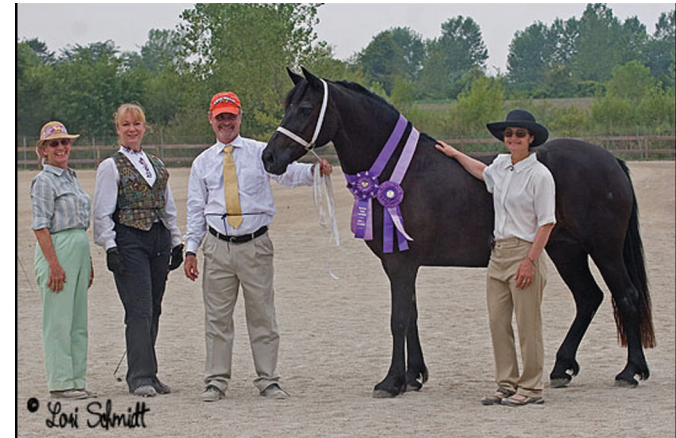
Section D Mare *Rhosyr Ebony (Gwenllan Brenin Mon x Rhosyr Dwynwen) 2011 National Reserve Champion Section D Mares Castleberry Welsh Cobs Spencer, IN