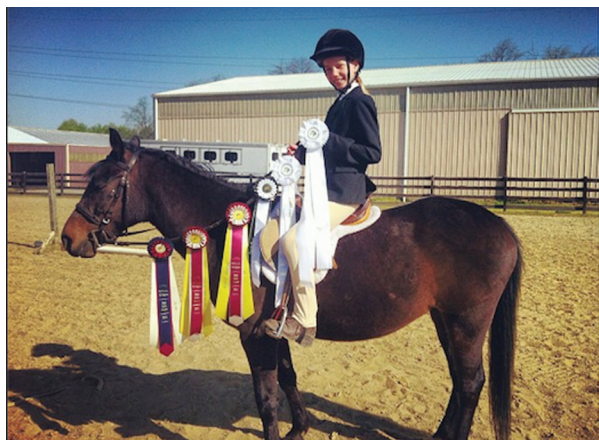
Half-Welsh Mare Brillwood Aliza (Clarwood Formally Attired x Wendover Way) Champion Walk/Trot North Central Region Reserve Champion Walk North Central Region 4th National High Point Walk/Trot RRR Farms Hamersville, OH