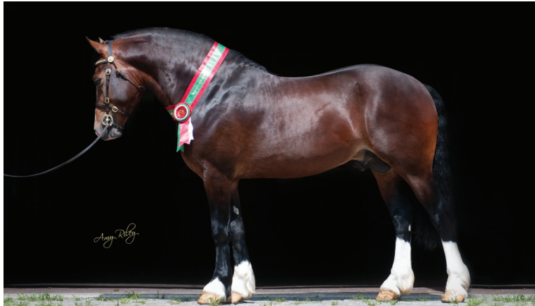
Section D Stallion *Nebo Knight Ryder (Geler Dago x Nebo Princess Di) 2011 American National Reserve Supreme Ch 2011 WPCSA National High Score Section D Stallion New York State Fair - Double Supreme Champion NEWPA - Double Supreme Champion Quillane Welsh Cobs Buzzards Bay, MA