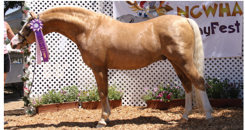
Section B Stallion Clanfair Signature, LOM (*Wedderlie Mardi Gras x *Holyoake Sucura) 2011 WPCSA US National Champion Sec. B Stallion WPCSA Individual Legion of Merit earned in 2011 2011 WPCSA SW Reg. Champion Sec. B Stallion BridleWood Welsh Paso Robles, CA