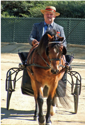
Section A Mare Silvandra's Lady Hawk (*Bengad Lynden x Smoke Tree Rhiwlett Lady) WPCSA Reserve Nat. Champion Carriage Driving WPCSA Nat. 3rd place Pleasure Driving (12.2 & under) NW Region Champion Carriage Driving Silvandra's Welsh Elmira, OR