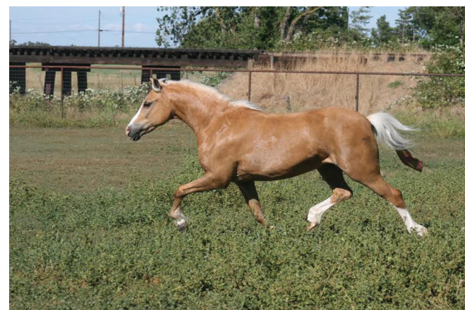
Section A Mare Pinedale Mountain Buttercup (Laurel Oaks Sunny Mountain X Chaparral's George's Best Bet) Legion of Merit Pinedale Ponies Creston, CA