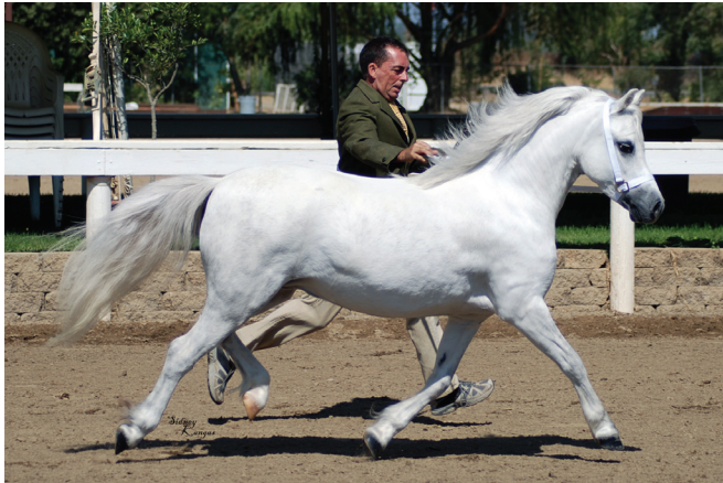
Section A Mare *Verdrefawr Marina (Verdrefawr King Cole x Verdrefawr Miriam) 2011 Nat'l High Point Sect. A Mare Bandy's Welsh Mtn. Ponies Powell Butte, OR