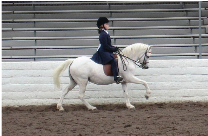
Section A Mare Gaslight Siwgr Baby LOM (Tri-Ef Cognac LOM x Smoke Tree Siwgr) Awarded her Dam LOM in 2011 Gaslight Farm Roseburg, OR