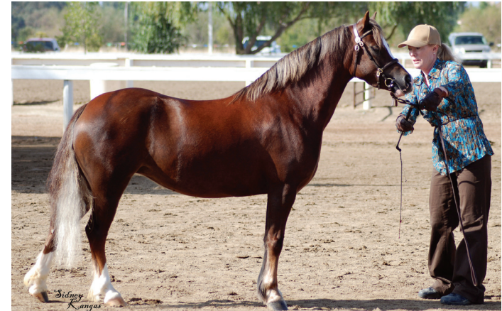
Section C Mare Gaslight Amber LOM (*Ceulan Lwcus LOM/AOE/OD x *Synod Aurora) Awarded her Individual LOM in 2011 WPCSA Nat'l High Score Sec. C Mare, C/D Adult Western Pleasure WPCSA Nat'l High Score Reserve Champion C/D Adult English Pleasure, Adult Trail Gaslight Farm Roseburg, OR