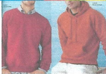
Crewneck Sweatshirt Hoodie

Crewneck Sweatshirt (50/50 cotton/polyester blend) Youth Small – Adult XL --$22.50 2XL -3XL – Add $2.00